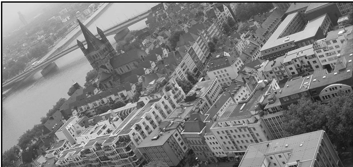
Aerial photograph of Cologne, Germany.